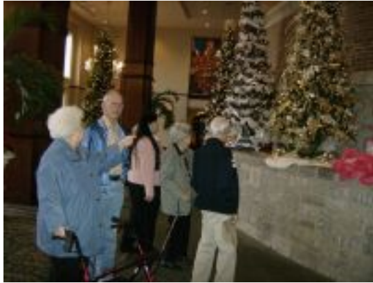
Picking a winner at Hotel Roanoke.