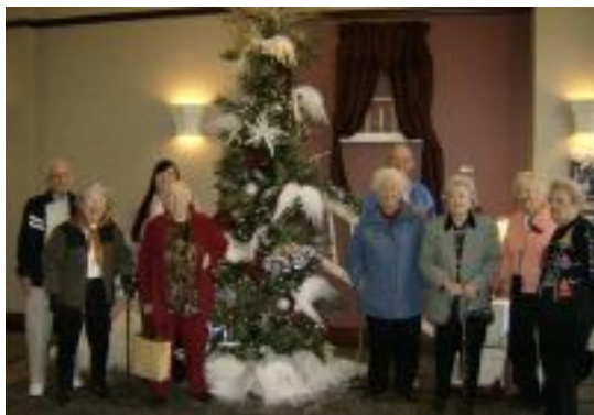
We found our favorite.