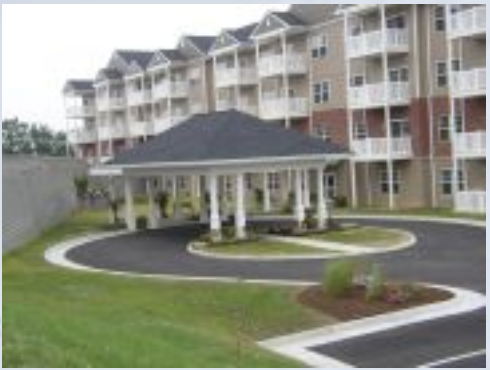
The Village on Pheasant Ridge.