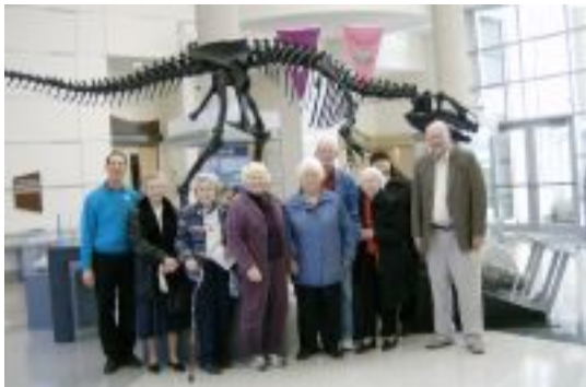
Natural History Museum