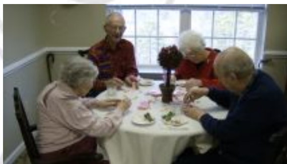
Stacking hearts contest