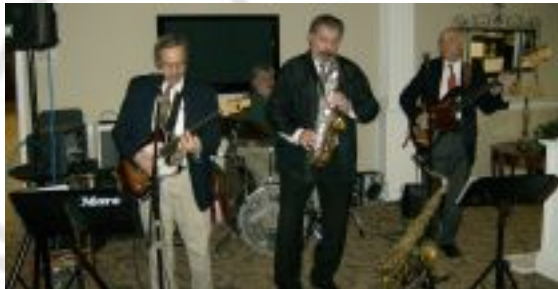
Entertained by the Caravan Band