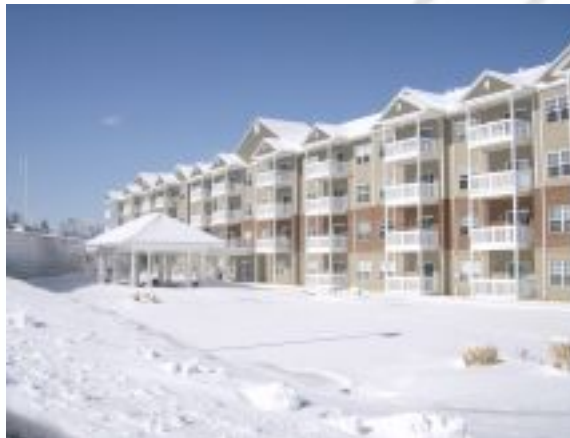
Snow blankets the Village