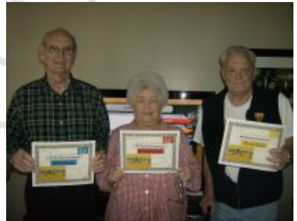
WINNERS of the Wii Bowling Tournament. Congratulations!