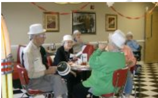
Beat the blahs of winter party